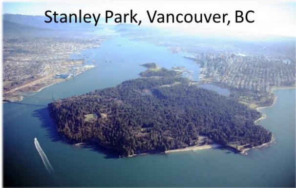
Stanley Park, Vancouver, BC

URBAN PARKS are delineated open spaces areas, mostly dominated by vegetation and water, and generally reserved for public use (Konijnendijk et.al.,2013)